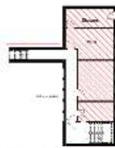
3D Axo Ground Floor